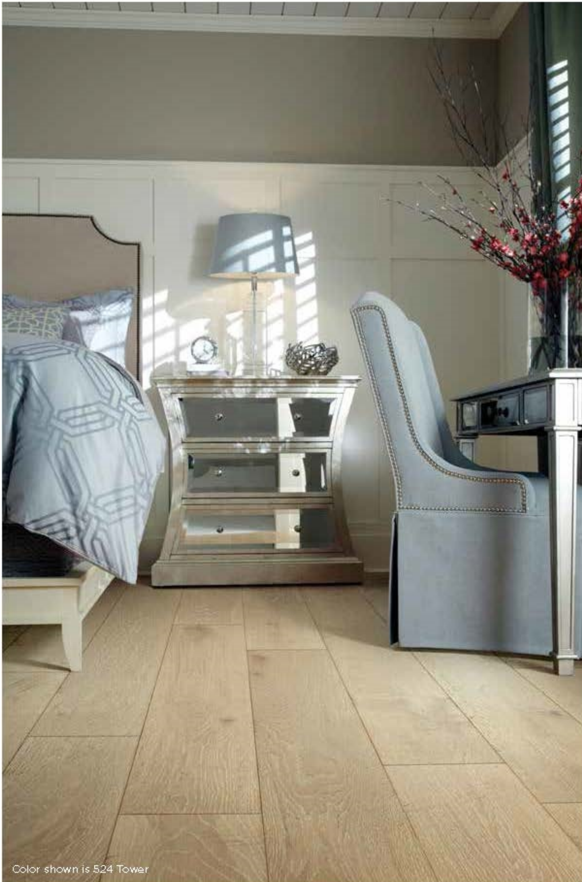
Color shown is 524 Tower